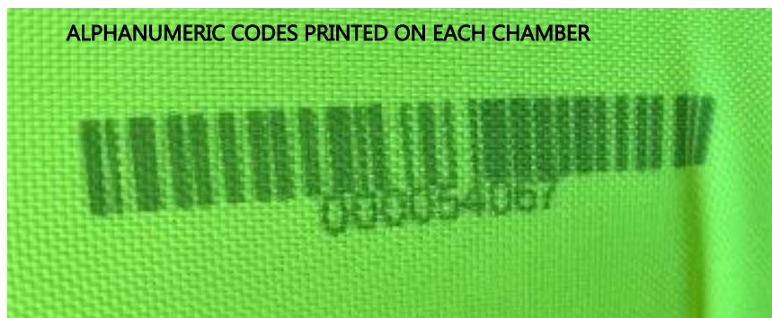
ALPHANUMERIC CODES PRINTED ON EACH CHAMBER

With the aim of making inflatable life jackets more reliable, in 1994 Veleria San Giorgio introduced the Unique Product Code system. As the only manufacturer in the world to employ this type of technology, VSG is now able to identify all materials and individual components utilised through distinct alphanumeric codes.