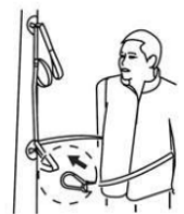
Quick-release hook and strap to go around the person