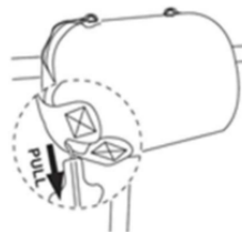
Detach and toss the signalling buoy into the water