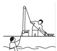
If the castaway is unable to climb on board, use a block and tackle