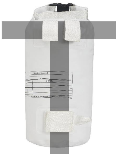
Placement of the DAN BUOY on the grab rail