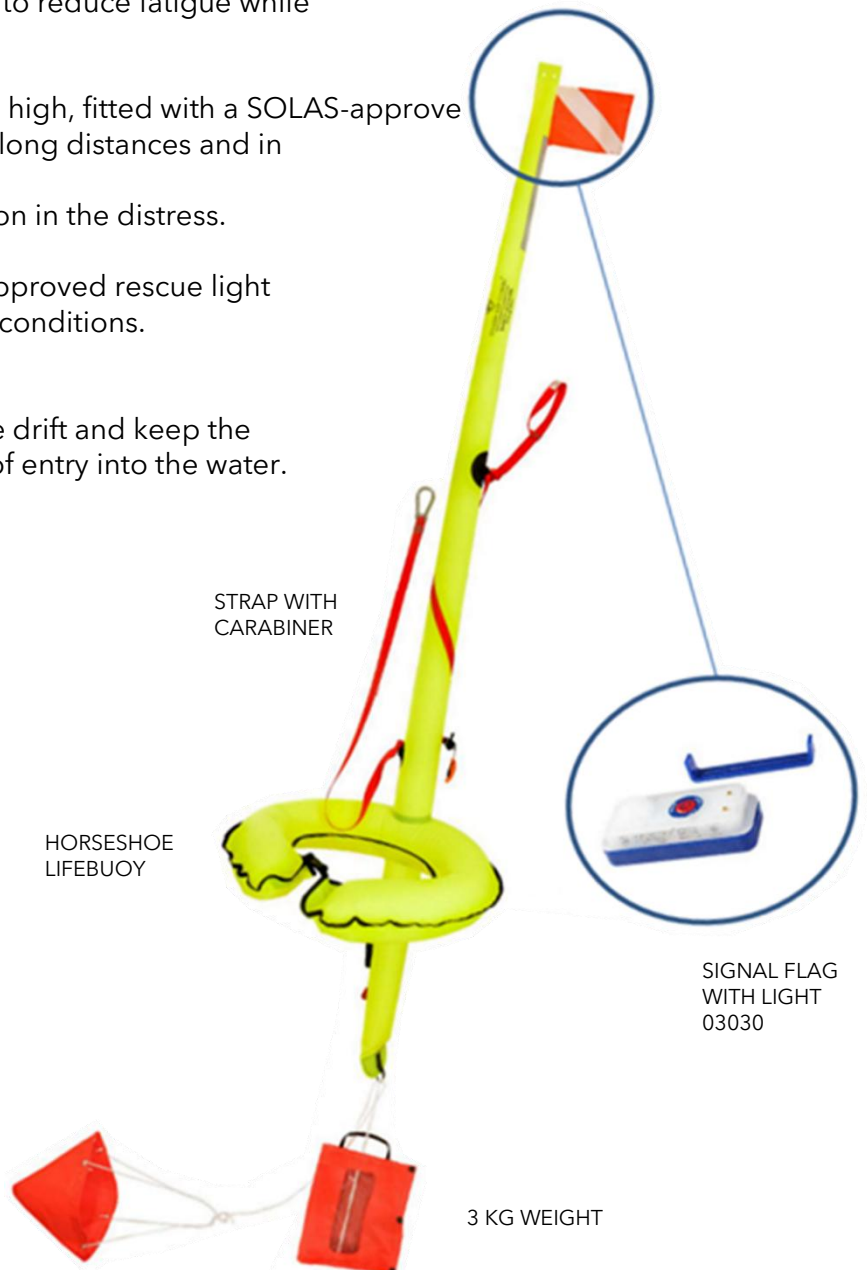
SIGNAL FLAG WITH LIGHT 03030