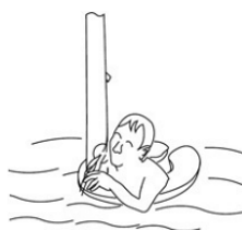
Hold onto the signalling buoy while awaiting rescue.