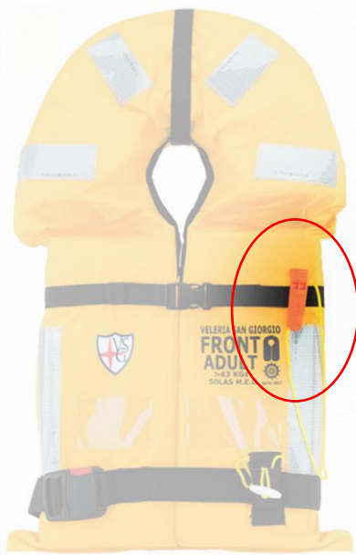
Positioning on a rigid life jacket