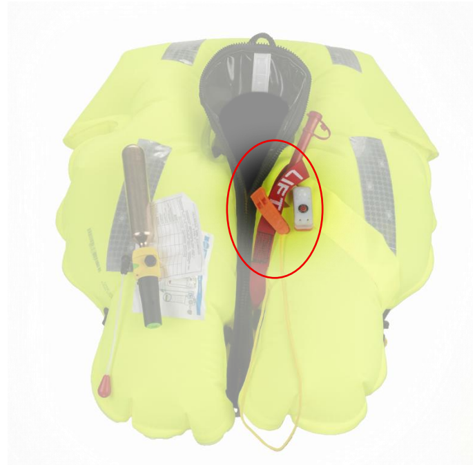
Positioning on an inflatable life jacket