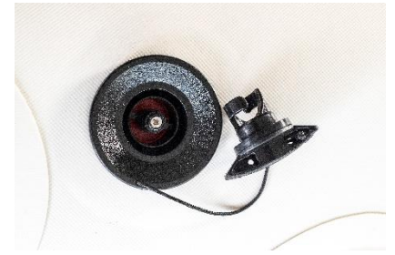
Inflation and deflation valve